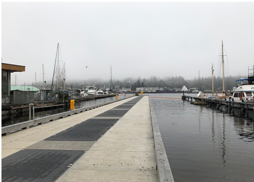
The reconstruction of the 24th Ave Pier was completed in 2019