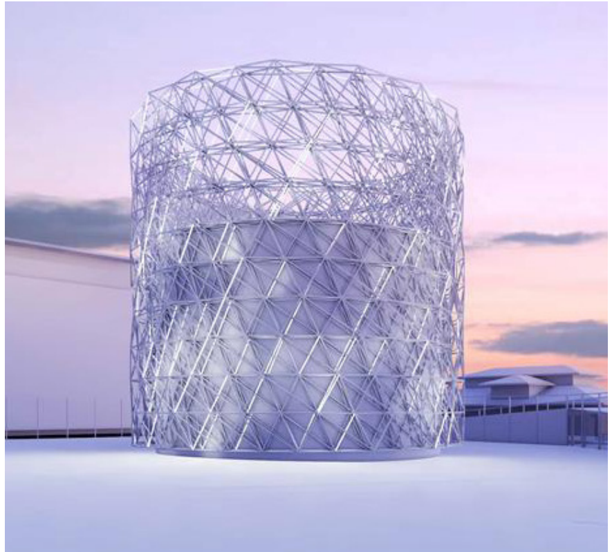
Rendering of the future Ballard Pump Station

Artist Jeffrey Veregge is working to create public art at the pump station site.