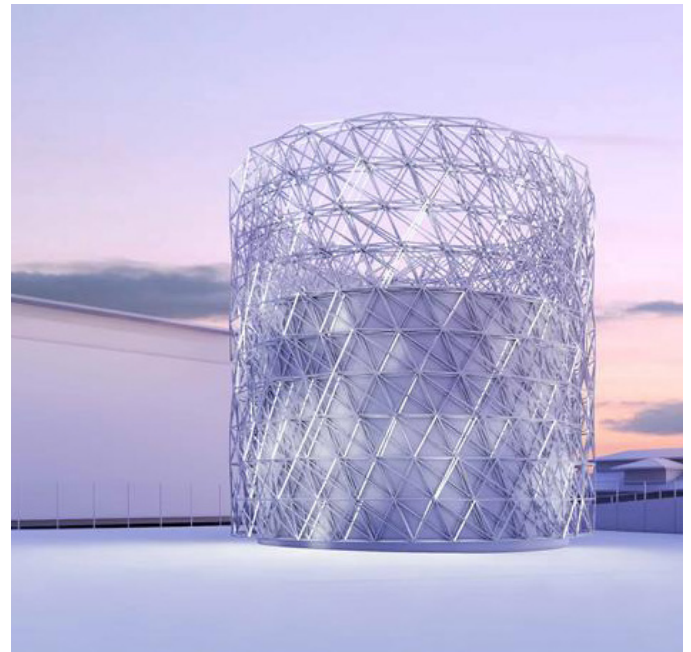
Rendering of future Ballard Pump Station