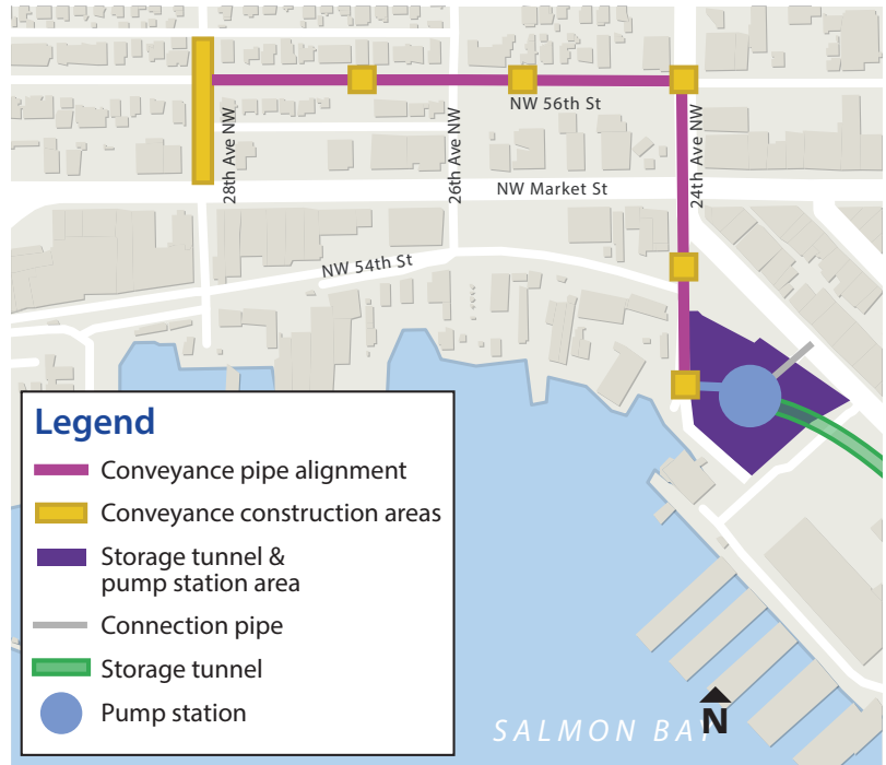
Ballard pump station and conveyance project area.

Ballard will be home to the western end of the tunnel and above-ground facilities, including a pump station. Tunnel boring started at this location and moved toward Fremont and Wallingford.