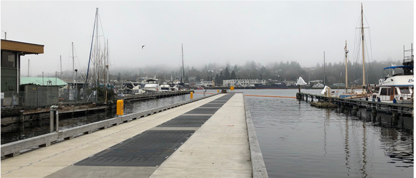
The reconstruction of the 24th Ave Pier was completed in 2019. The pier is open to the public.