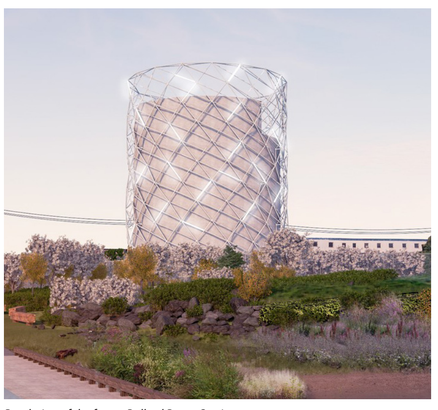
Rendering of the future Ballard Pump Station

In addition to the Ballard Site and pump station, we will be building new pipes along NW 56th St, 28th Ave NW, and 24th Ave NW to connect Ballard's existing sewer and stormwater overflow pipes to the storage tunnel.