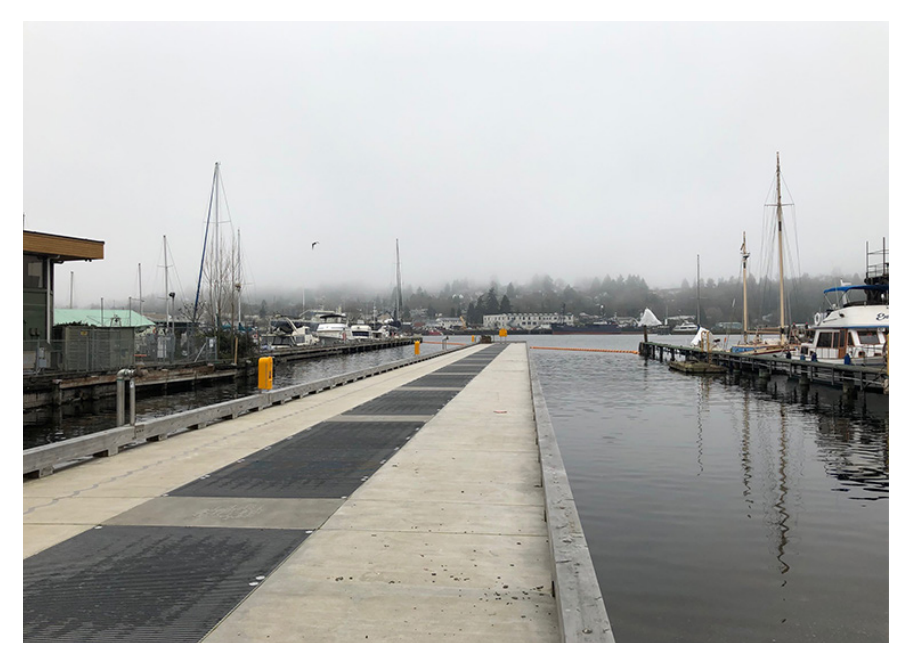
The reconstruction of the 24th Ave Pier was completed in 2019